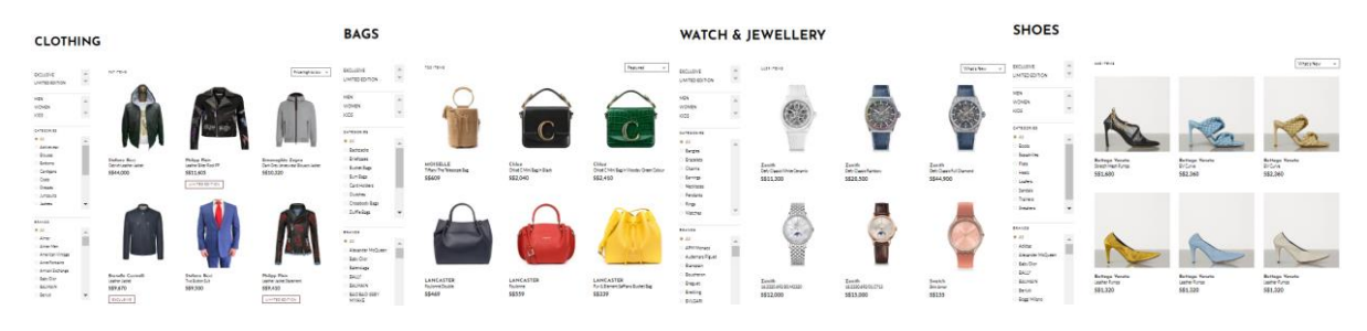
The Shoppes Edit enables shoppers to breeze through the season's first dibs and limited edition items seamlessly online

Driven by the depth of exclusive products at The Shoppes, <u>The Shoppes Edit</u> was launched in 2018 as a one-stop digital portal for fashion lovers to browse over 4,000 of the season's latest trends for every occasion, ranging from watches and jewellery, to fashion and children's apparel.