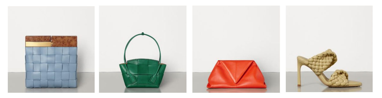
The Shopping Concierge lists a selection of 80 products from Bottega Veneta's Spring/Summer 2020 collection. (From L-R): BV Snap in Ice, Mini Arco in Racing Green, Envelop Clutch in Orange, and BV Curve in Tapioca.

Fans of Bottega Veneta would be thrilled to learn that top hits from the Italian luxury brand's Spring/Summer 2020 ready-to-wear runway show are now within reach at the click of a button. Led by the ingenious Daniel Lee, creative director of the Italian fashion house, this collection includes as many as 80 'IT' bags and shoes of the season – including the Arco, BV Snap, and Envelop Clutch – and cult-classics like the BV Curve sandals featuring the brand's iconic intrecciato weaving technique.