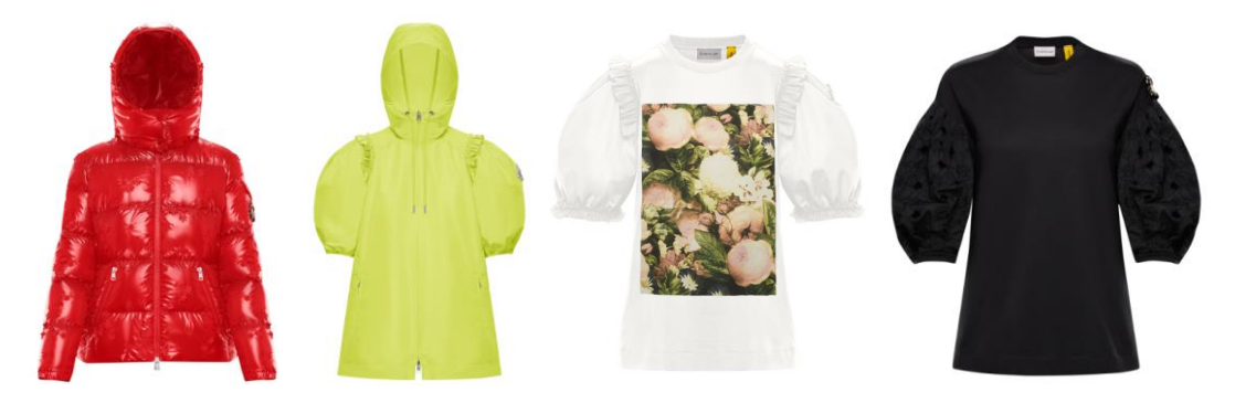
The '4 Moncler Simone Rocha' collection is exclusive to The Shoppes. (From L-R): 4 Moncler Simone Rocha Callitris in Red, 4 Moncler Simone Rocha Pansy in Lime, 4 Moncler Simone Rocha T-Shirts in white and black.

Fashion purveyors can now shop a curated collection of coats and t-shirts from 4 Moncler Simone Rocha, a collaboration between Moncler Genius and the award-winning designer. Exclusive to its existing flagship duplex store located at The Shoppes, these apparel are just some of the many items available for delivery, along with the French-Italian brand's signature parkas, nylon technique jackets and sneakers.